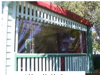
outside and inside view

blinds are able to be zipped together great for covering large areas. Zips only available for Clear PVC and Mesh.