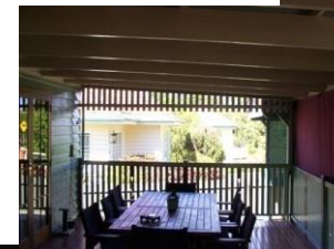
Clear PVC and Acrylic together