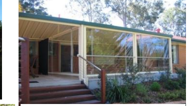
Clear blinds outside and inside view